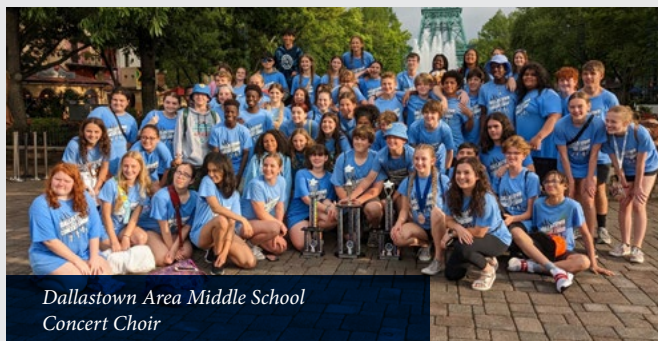
Dallastown Area Middle School Concert Choir