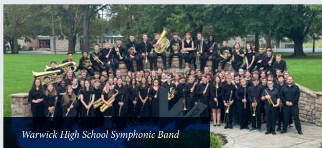
Warwick High School Symphonic Band