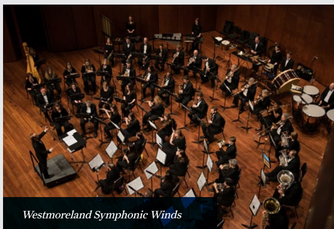
Westmoreland Symphonic Winds