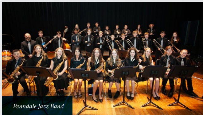
Penndale Jazz Band