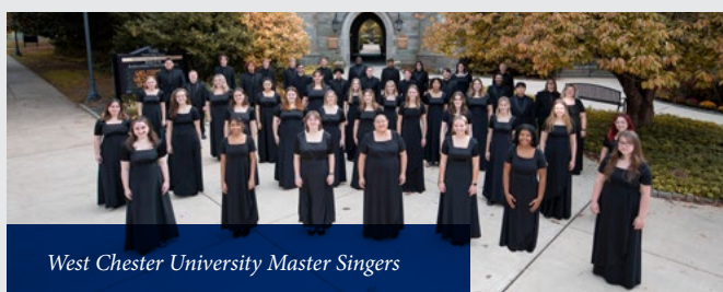
West Chester University Master Singers