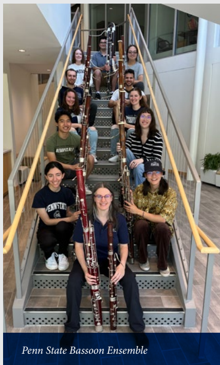
Penn State Bassoon Ensemble