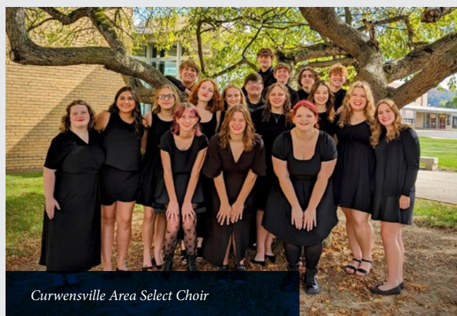
Curwensville Area Select Choir