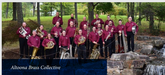
Altoona Brass Collective