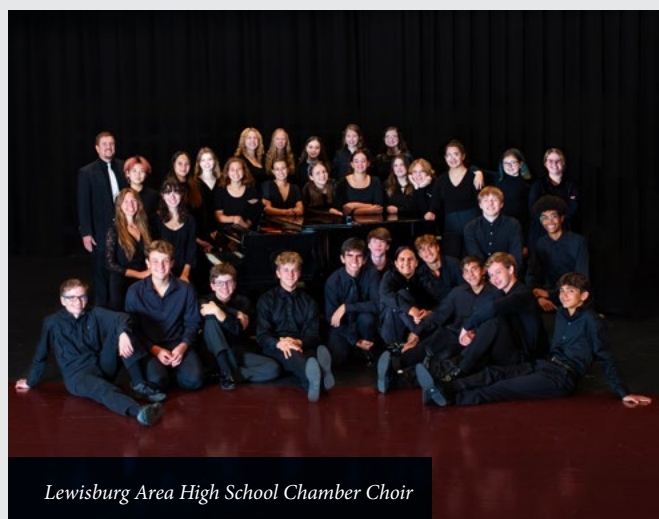
Lewisburg Area High School Chamber Choir