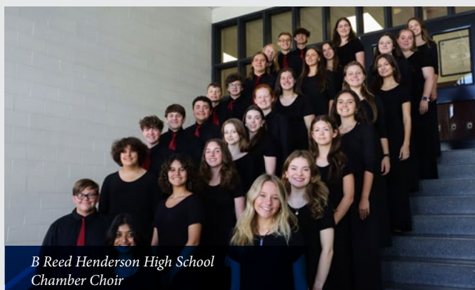
B Reed Henderson High School Chamber Choir