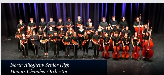
North Allegheny Senior High Honors Chamber Orchestra