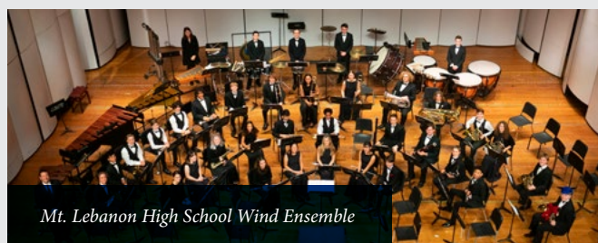
Mt. Lebanon High School Wind Ensemble