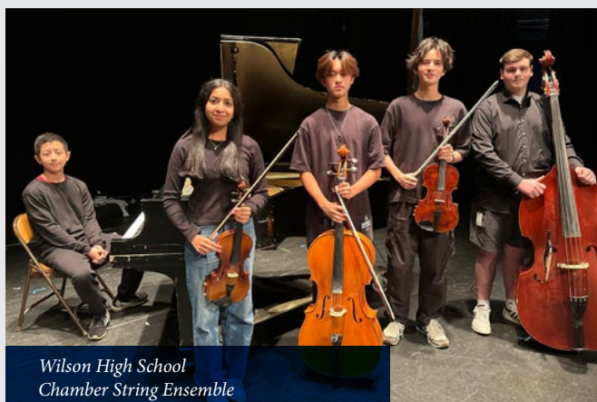
Wilson High School Chamber String Ensemble