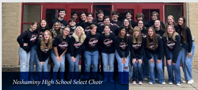
Neshaminy High School Select Choir