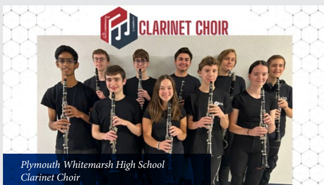
Plymouth Whitmarsh High School Clarinet Choir