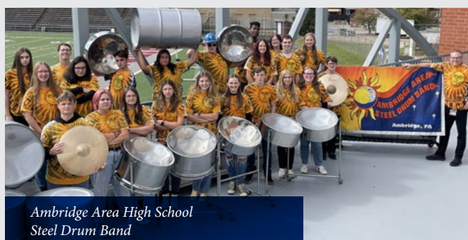
Ambridge Area High School Steel Drum Band