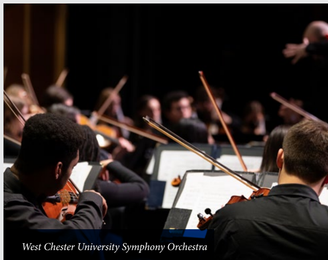
West Chester University Symphony Orchestra