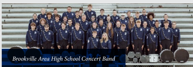
Brookville Area High School Concert Band