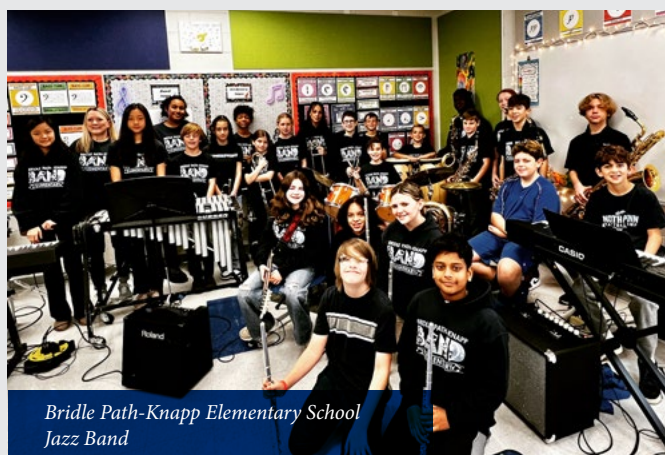
Bridle Path-Knapp Elementary School Jazz Band