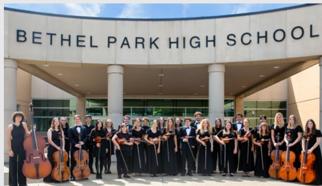
Bethel Park High School Chamber Orchestra