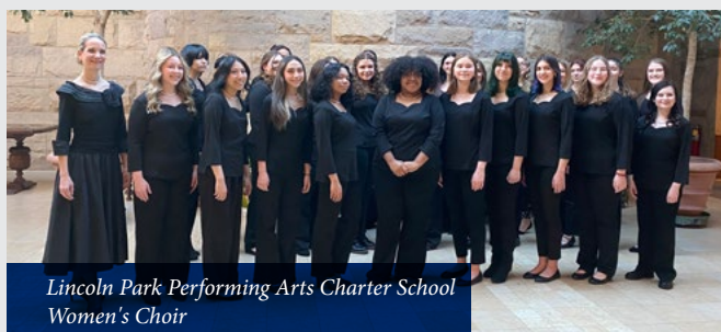
Lincoln Park Performing Arts Charter School Women's Choir