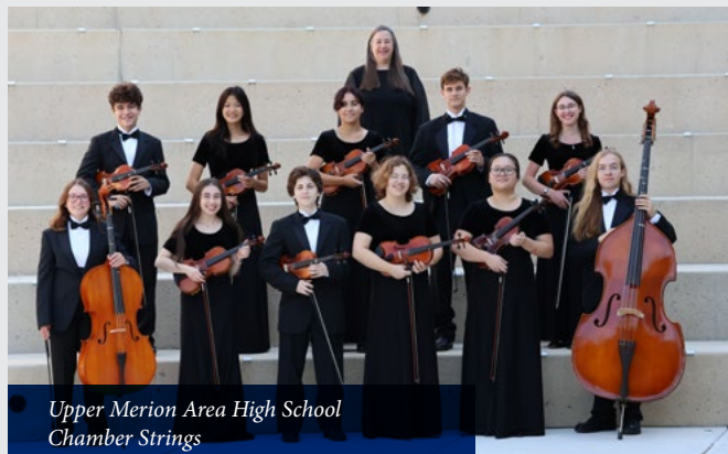
Upper Merion Area High School Chamber Strings