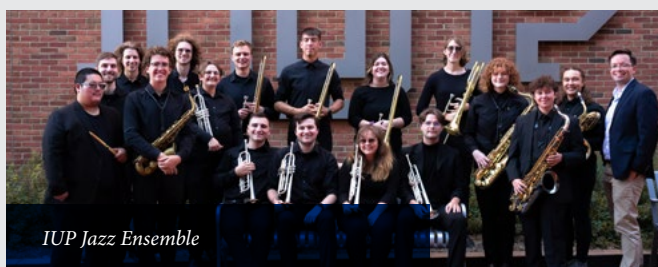
IUP Jazz Ensemble