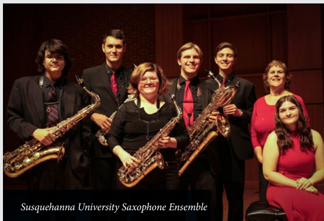
Susquehanna University Saxophone Ensemble