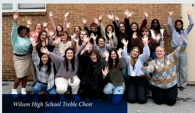
Wilson High School Treble Choir