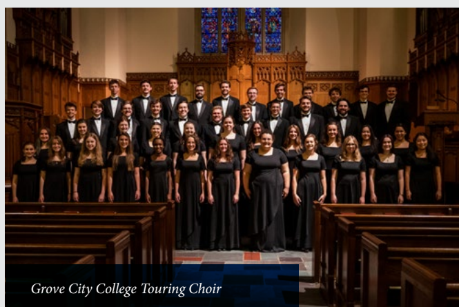
Grove City College Touring Choir