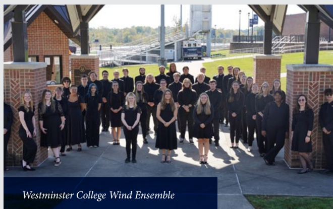
Westminster College Wind Ensemble