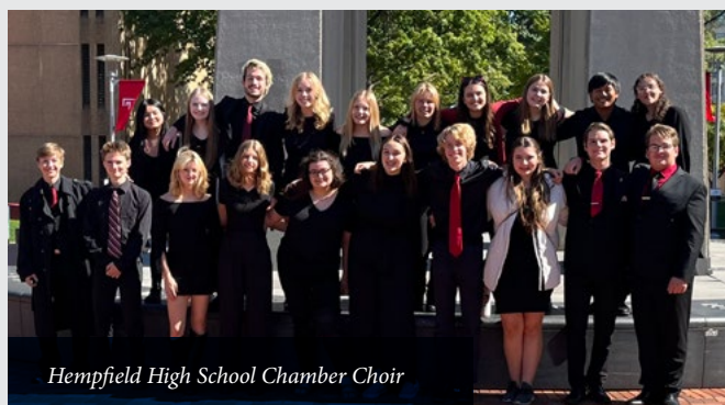
Hempfield High School Chamber Choir