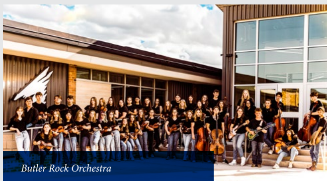
Butler Rock Orchestra