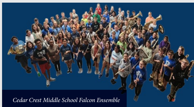
Cedar Crest Middle School Falcon Ensemble