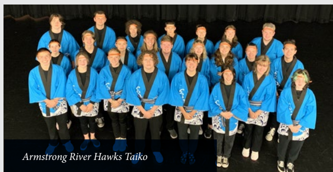
Armstrong River Hawks Taiko