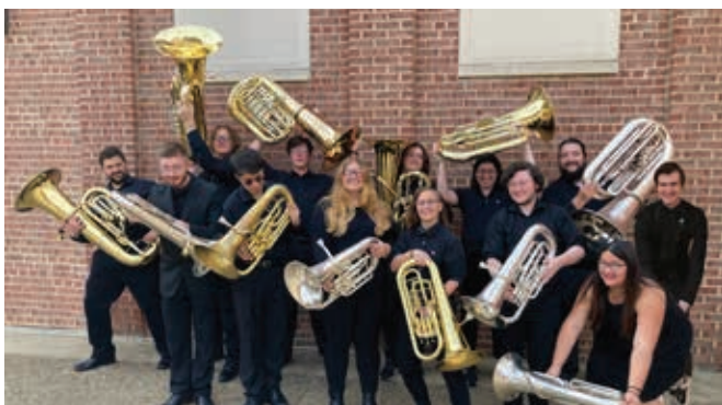
IUP TUBAPHONIUM ENSEMBLE