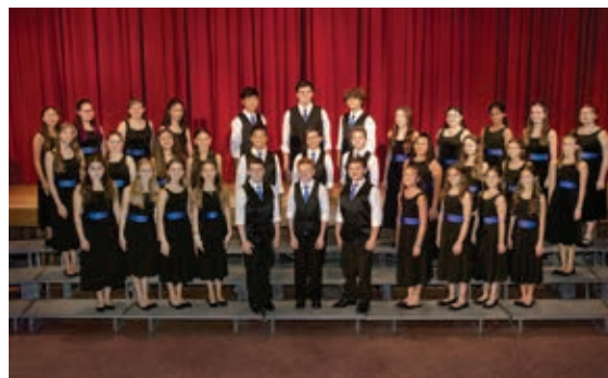
POQUESSING MIDDLE SCHOOL SELECT CHOIR