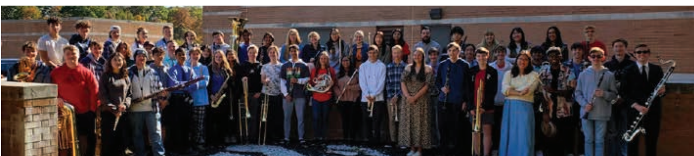
NORTH PENN HIGH SCHOOL WIND ENSEMBLE