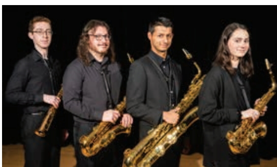
DUQUESNE UNIVERSITY SAXOPHONE QUARTET