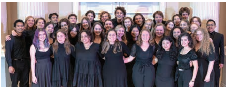
GETTYSBURG COLLEGE CHOIR