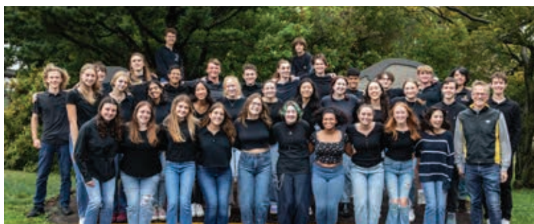
THE SILVERTONES OF STRATH HAVEN HIGH SCHOOL