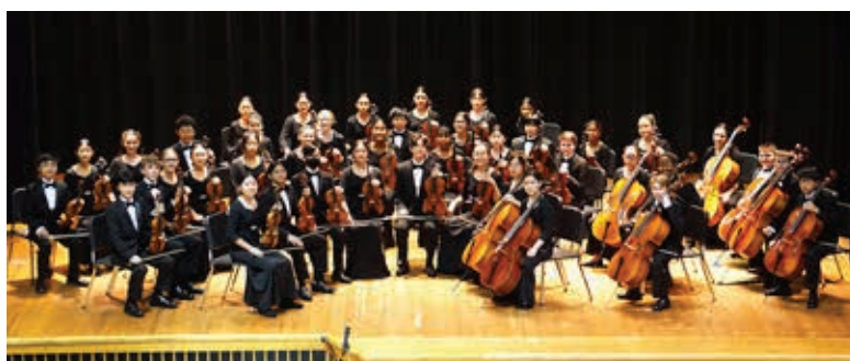
NORTH PENN MIDDLE SCHOOL SINFONIA