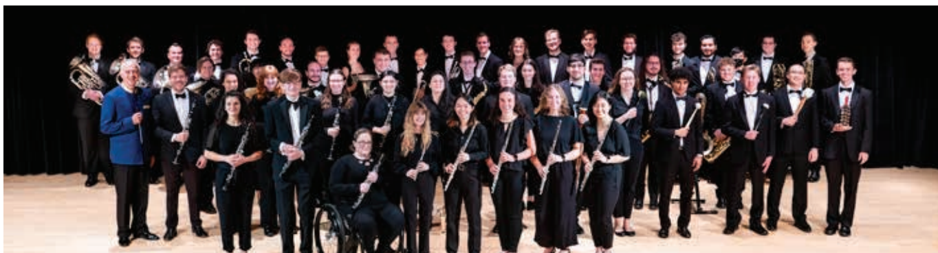
DUQUESNE UNIVERSITY WIND SYMPHONY ORCHESTRA