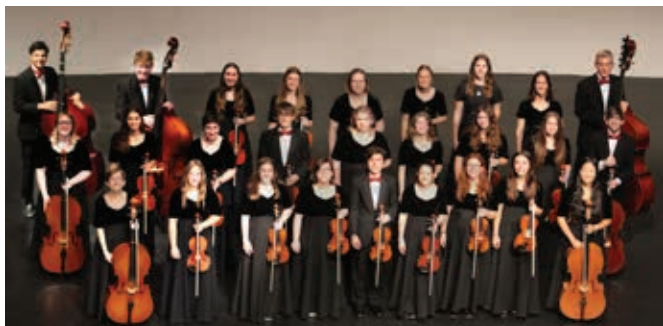
MILLIONAIRE STROLLING STRINGS