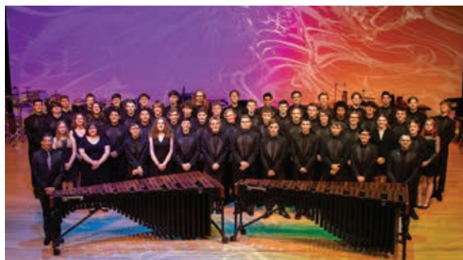
MT. LEBANON PERCUSSION ENSEMBLE