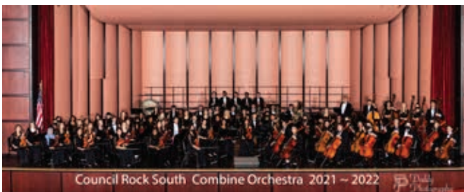
COUNCIL ROCK SOUTH ORCHESTRA