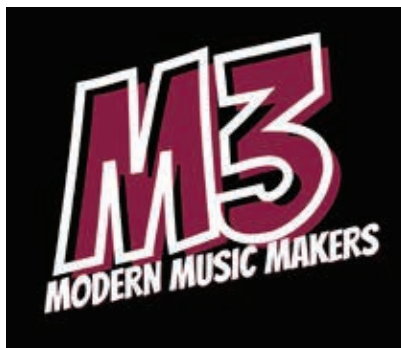
M3 THE BAND - DETOUR AND GIRL COLORS