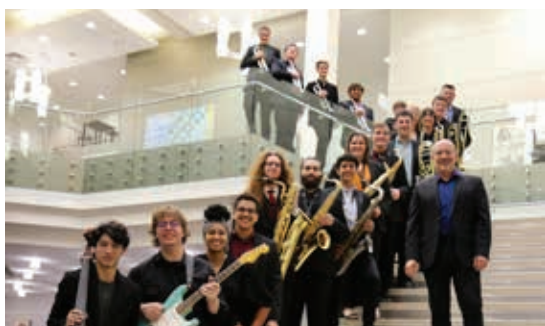
THE MECHANICSBURG AREA SENIOR HIGH JAZZ ENSEMBLE