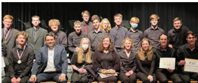
MESSIAH UNIVERSITY CONCERT CHOIR