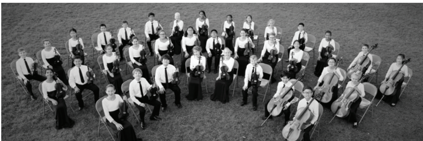
BRIDGE PATH/MONTGOMERY SELECT STRING ENSEMBLE