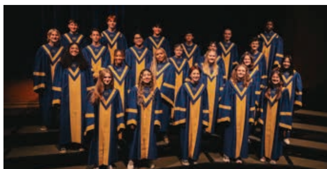
CEDAR CLIFF HIGH SCHOOL CHAMBER SINGERS