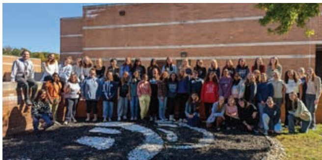
NORTH PENN HIGH SCHOOL TROUBADOURS