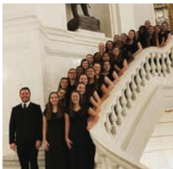
CENTRAL DAUPHIN CHANSON