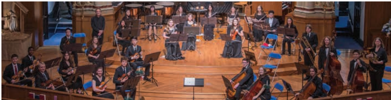
YOUNG PEOPLE'S PHILHARMONIC OF THE LEHIGH VALLEY