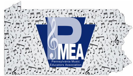
Music Education Advocacy Day

Retired members' voices are critical to the goal of making music and arts education a reality for every child in Pennsylvania. Here is some of the information about the PMEA Music Education Advocacy Day on March 20 that has been posted at http://cqrcengage.com/pmea/17advocacy . You should visit this link to receive the 2017 PMEA Legislative Recommendations with Talking Points, our PMEA "asks," and background for you to be aware of prior to your legislative meetings.